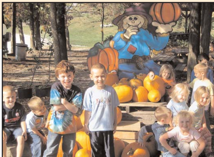
The Fireflies, Busy Bees and Crickets visited Apple Works. Here are some of our 'big kids' enjoying some sunny pumpkin fun!